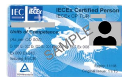
ID Card (Sample)